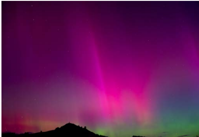
This stunning image of the Auroa Australis over Puketapu, was taken by Zenobia Southcombe.