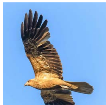
Kahu image taken by Paul Balfe